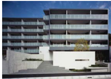
Form of Place Project 2007