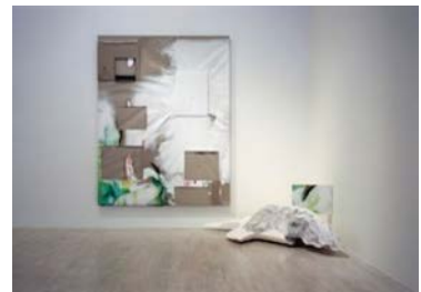
Seeds-4 Pruning Tree Creation of new growth air and light 2007