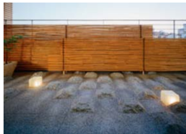
Space above Cloud 2000