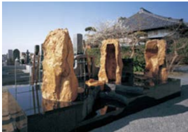
Tomb of the Toriumi Family- Blessed Garden, 2004