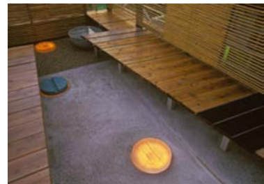
GARDENS NOW [heaven · 02] 2002