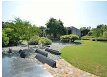
Homogenous Garden 2005