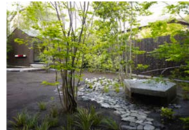
Black Soil and Hexagon Garden 2008